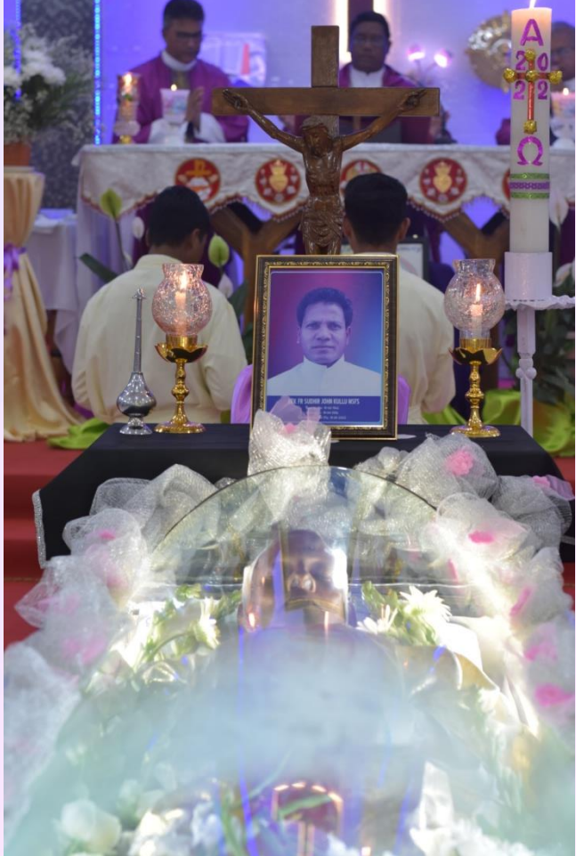
Requiem Mass in SFS Parish Silapathar